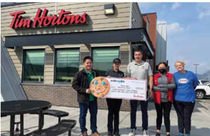
Tim Hortons Kananaskis Smile Cookie Contribution to OTET 2023