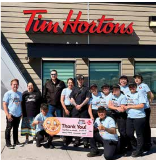
Tim Hortons Kananaskis Smile Cookie Contribution to OTET 2026

The Trustees' overall management and administrative functions are defined by the OTET trust deed and policies. These include the duties and responsibilities to carry out the purpose of the Trust and to encourage, support and provide supplementary financial assistance to qualifying Bearspaw members attending accredited post-secondary education institutions. The Board is responsible for all financial and administrative aspects of the Trust Fund and operates independently from Chief and Council, Stoney Education and the Bearspaw and STA Administrations.